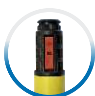
HEXAGON 12 C TYPE