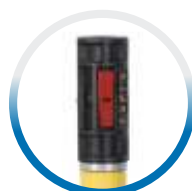
HEXAGON 12 F TYPE