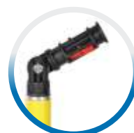
HEXAGON 12 R TYPE