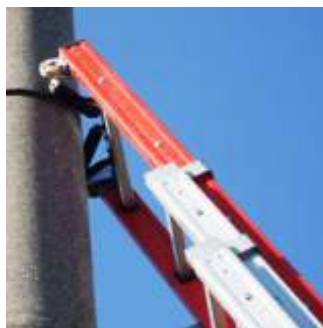
Support, rolling and fastening device