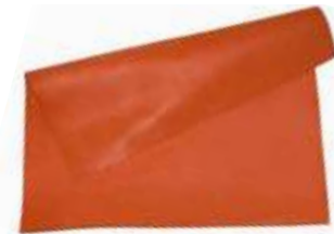
RUBBER FOIL (BLANKET)