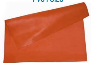
RUBBER FOIL (BLANKET)