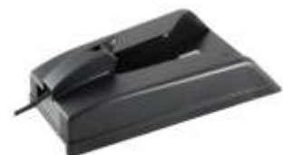
CHARGER SUPPORT + CHARGING CABLE 230 V AC