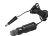
CAR CHARGING CABLE