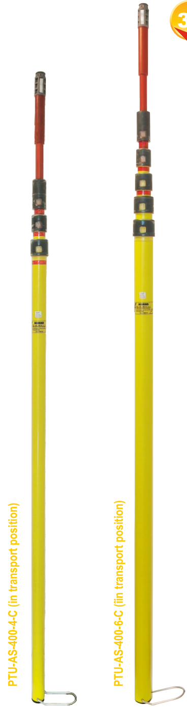
PTU-AS-400-4-C (in transport position)